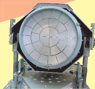
Easy clean as tilting the head. Easy operation for anybody.