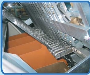
Solid-Built Lattice and Fingers