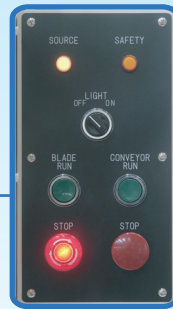
Simple Operation Panel