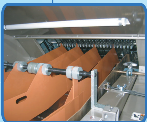
Simple Discharge Conveyor, Easy Replaceable Separating Plates